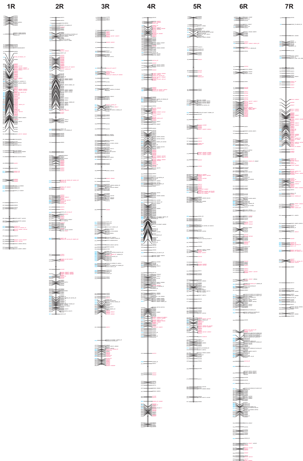
Figure 4 Genetic linkage map of the cross L318xL9 containing 1818 loci. Loci with distorted segregations at p < 0.01 are indicated by asterisks and shown in red. DArT markers with chromosomal location determined using addition lines are indicated by the symbol of the respective chromosome added after underscore, their map locations are shown in blue.